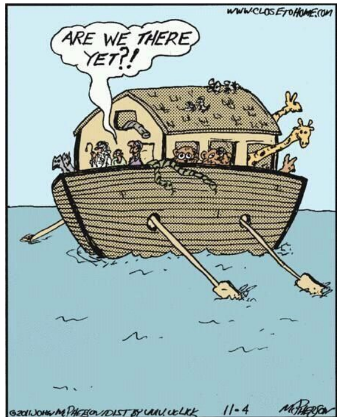
The famous question is asked for the first time.