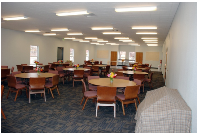
Fellowship Hall Interior