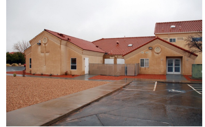
Back of Fellowship Hall and New Entry