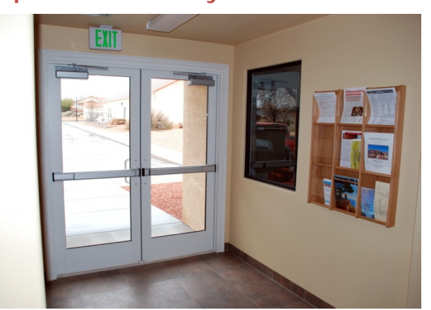
New Entry Door to Narthex