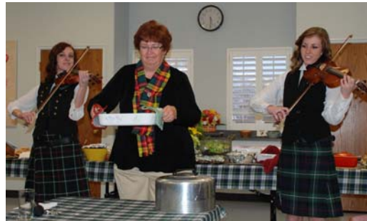
Presentation of the Shepherds Pie