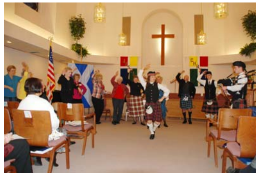
Dancing a Highland Fling

What's better than an evening of Shepherds' Pie, Haggis, toasts and jokes, bagpipes and fiddles?