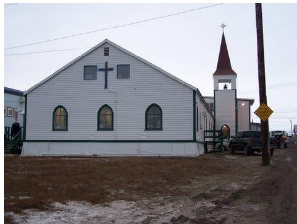
Vacation Bible School in July 2016 at Utqiagvik Presbyterian Church in Barrow, Alaska.

Hopefully, I will be able to plan a trip to St. George soon! All the best to each of you!