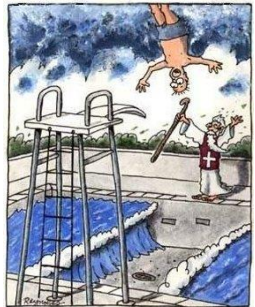
Moses' first and last day as a lifeguard.

The secret of a good sermon is to have a good beginning and a good ending; and to have the two as close together as possible.