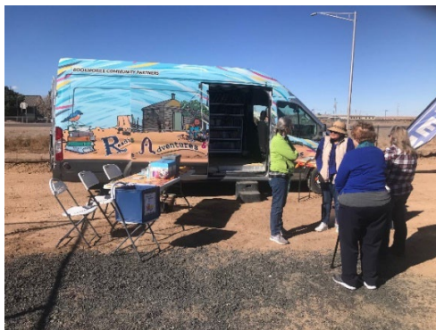
The Navajo Bookmobile